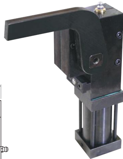
Min.7 bar air pressure

The robust pneumatic Çizmak clamp is designed for continuous use in rotation. Solid steel housing, with temperature-resistant special seals.